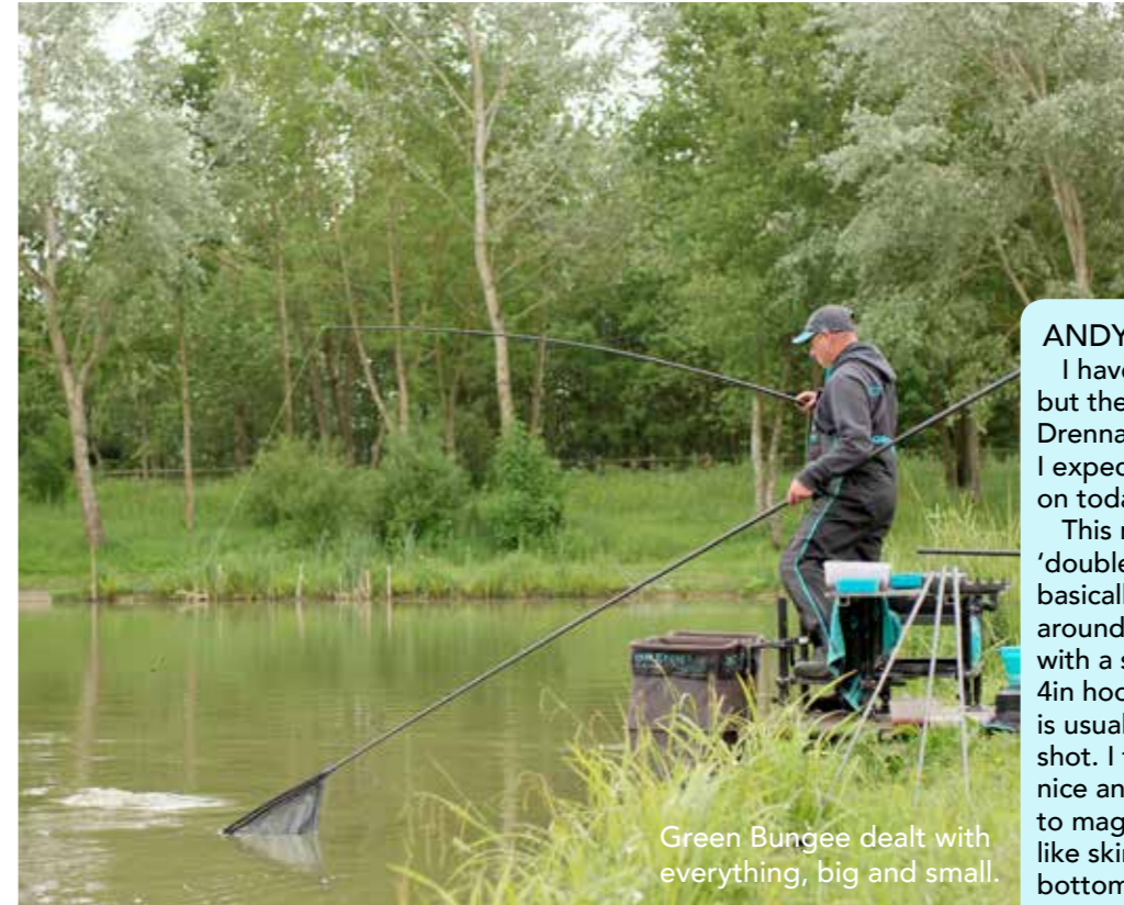
Green Bungee dealt with everything, big and small.