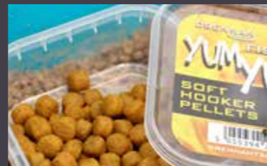
A 6mm Sweet Fishmeal Yum Yum tempted an early flurry of bites.