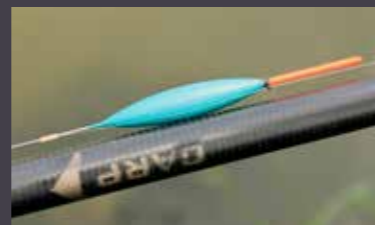
All of Dan's top kits sported Carp 5 pole floats, which are slim, sensitive and very stable.